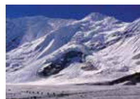
The Fantastic Mountains of Pakistan